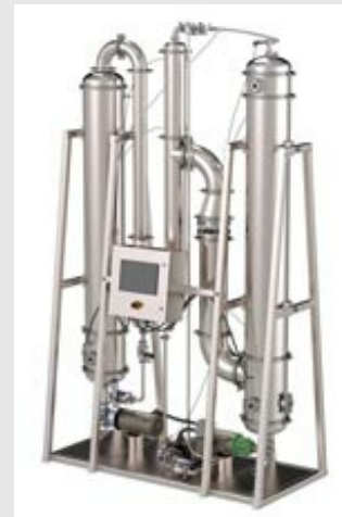
CBD Extraction System with Pulsafeeder ISOChem and ECO Gear Pumps