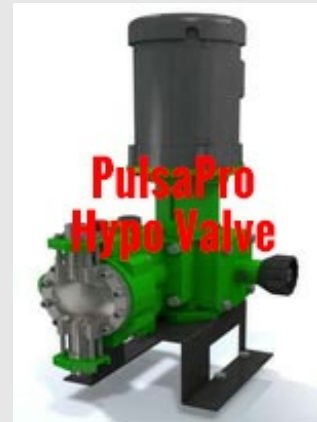
PulsaPro Hypo Valve

Our Eclipse Rotary Gear pumps will be featured in the September issue of Pumps & Systems Magazine , discussing disinfection applications with sodium hypochlorite. The story offers a deep dive into the history of water disinfection. It identifies the strengths & weaknesses of disinfection chemicals, and it discusses the challenges that pumps need to overcome to